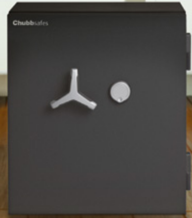
MODEL SHOWN: DUOGUARD 110 KEY LOCK